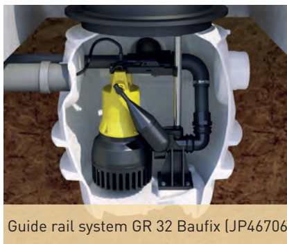
Guide rail system GR 32 Baufix (JP46706)