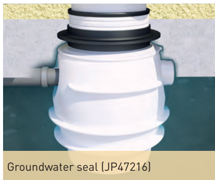
Groundwater seal (JP47216)