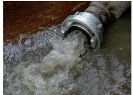
● Step 3: Start pumping