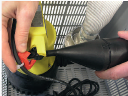
● Step 2: Switch on the pump