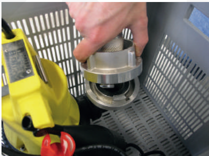
● Step 1: Attach the hose